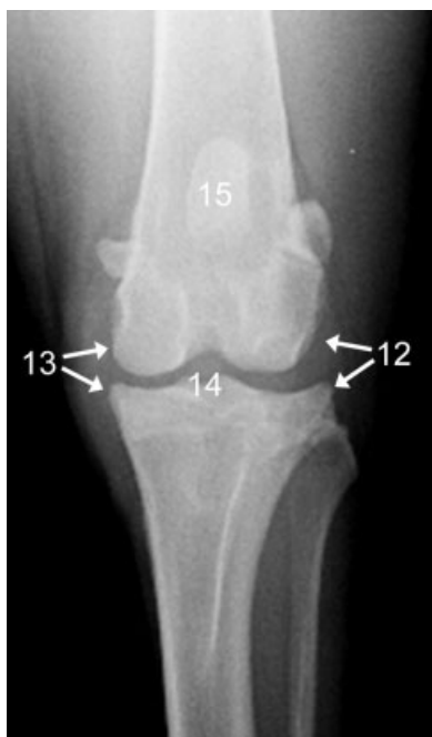
Fig. 2 Assessment points in the caudocranial view. 12, lateral tibial and femoral condyle; 13, medial tibial and femoral condyle; 14, intercondylar notch; 15, patella.