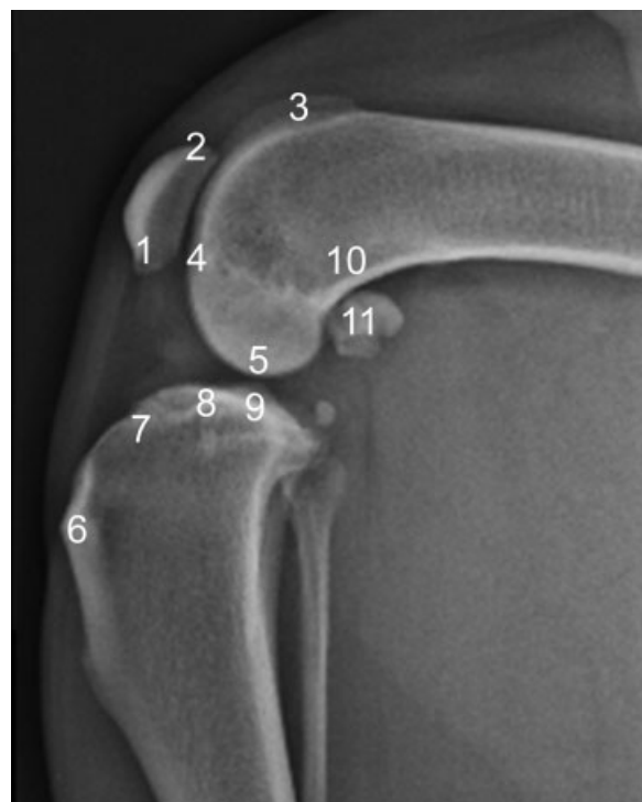
Fig. 1 Assessment points in the mediolateral view. 1, patellar apex; 2, patellar base; 3, proximal trochlear ridge; 4, distal trochlear ridge; 5, femoral condyle; 6, tibial tuberosity; 7, cranial aspect tibial plateau; 8, caudal aspect tibial plateau; 9, central aspect tibial plateau; 10, popliteal surface femur; 11, sesamoid bones.

The intra-observer variability estimate based on 95% confidence interval was defined as the minimal difference between two consecutive measurements made by the same observer. Intra-observer variability was determined by the method of residuals described by Bland and Altman 16 and Caylor and colleagues, 17 with the differences between measurements plotted against the mean. In addition, the mean differences in measurements between the first and second observations for each observer were determined. The inter-observer variability estimate based on 95% confidence interval was defined as the minimal difference between two consecutive measurements made by two different