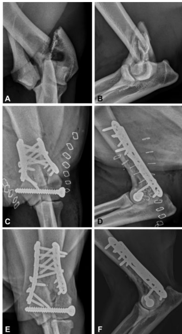
Fig. 1 Case 4 (Labrador Retriever) preoperative caudocranial (A) and mediolateral projections (B) showing simple condylar humeral fracture with a short lateral and long medial component. Immediate postoperative caudocranial (C) and mediolateral (D) views showing a medial 2.7-mm and lateral 2.4-mm locking compression plate, using hybrid fixation with a 4.5 mm transcondylar positional cortical screw. A small intra-articular gap persists consistent with humeral intracondylar fissure pathology and the articular step defect is 0.7 mm. (E) Caudocranial and (F) mediolateral views at the 8-week postoperative stage showing ongoing intracondylar gap, with remodelling supracondylar fracture lines.

Short-term outcome was considered fully functional in 9/13 patients. This included case 8, which has a grade 7/10 lameness on the repaired limb at 2.5 weeks postoperatively with septic