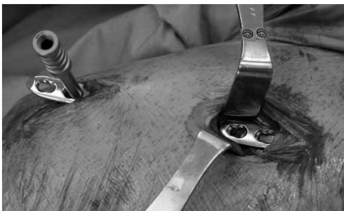
Fig. 2 Minimally invasive plate osteosynthesis stabilisation of a comminuted femoral fracture in a dog. A locking compression plate has been inserted from distal-to-proximal, sliding the plate through the epiperiosteal tunnel. The locking compression plate's drill guide can be utilised as a handle to facilitate insertion and positioning of the plate.

The plate is inserted through one of these incisions and slid through the soft tissue tunnel adjacent to the surface of the bone, and over the fracture site until the end of the plate is visible in the second incision (38, 57, 75) (► Fig. 2). If available, fluoroscopy should be used to confirm that the plate is properly contoured and positioned on the bone (36, 45, 51). If necessary the plate can be removed and re-contoured (59). Precise contouring and positioning of the plate becomes less critical if a locking plate is used (5, 12). Once the plate is fitted to the bone, screws are placed.