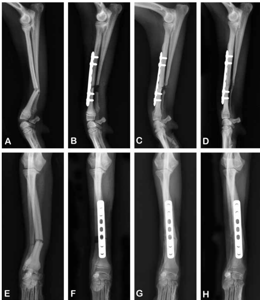
Fig. 4 Pre-operative, post-operative and follow-up radiographs of a radial fracture repaired with minimally invasive plate osteosynthesis. A seven-hole, 2.0 mm limited contact dynamic compression plate has been applied on the dorsal surface of the radius. A) and E) Pre-operative medio-lateral and cranio-caudal radiographs; B) and F) immediate post-operative medio-lateral and cranio-caudal radiographs; C) and G) four-week follow-up medio-lateral and cranio-caudal radiographs; D) and H) eight-week follow-up medio-lateral and cranio-caudal radiographs.

to full weight-bearing ranging from six to 22 weeks and times to union ranging from eight to 29 weeks (eight to 42 weeks including delayed unions) (55, 56, 76). Post-operative complications occurred infrequently and were similar to those seen with other internal fixation techniques, including superficial or deep infection, screw loosening or breakage, implant failure, delayed union, malunion, nonunion, and re-operation (28, 37, 38, 50, 55, 59).